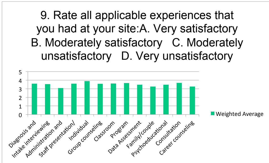
Figure 3. Students' Overall Satisfaction with the Site Experience